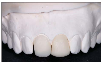
Figure 3: f – Model frames