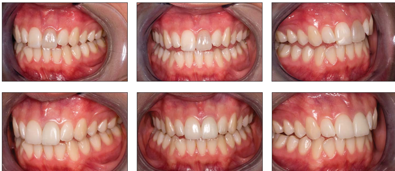
Figure 2b: a-f – Retracted: Before (above) and after (below) images of the case

using fujirock EP, which would be used for verification of contacts and tissue contour.