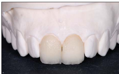
Figure 3: a – Bisque 1

Without this layer, any additional layers run the risk of cracking or delamination. The grainy surface also helps to refract light as it passes through the ceramic. A thin wash of stain was then applied to