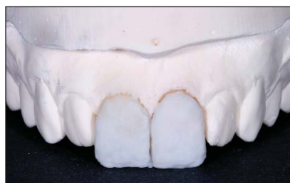
Figure 3: d – Build 2