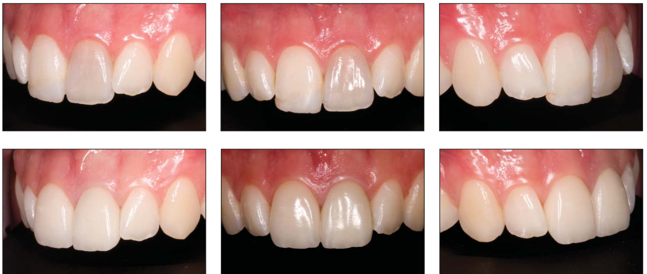
Figure 2a: a-f – Before (above) and after (below) images of the case

placed around each sleeve, to stop any air pockets forming around them, before seating the model into the base. This was then allowed to set for a further hour before removal. The two parts were then separated and the cast impression was sectioned with a pindex saw to allow removal of the working dies. An additional solid cast was also made