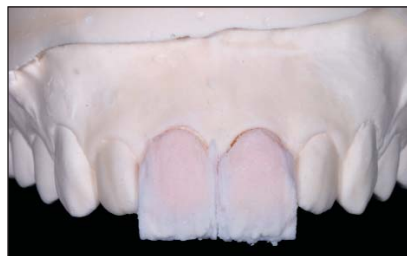
Figure 3: c – Build 1