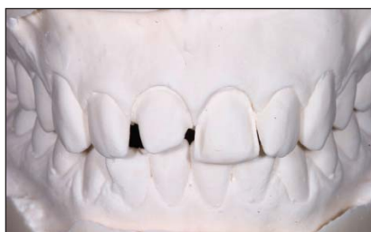
Figure 3: h – Model articulated