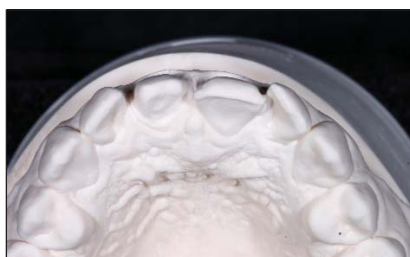
Figure 3: g – Model occusal