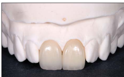
Figure 3: b – Bisque 2