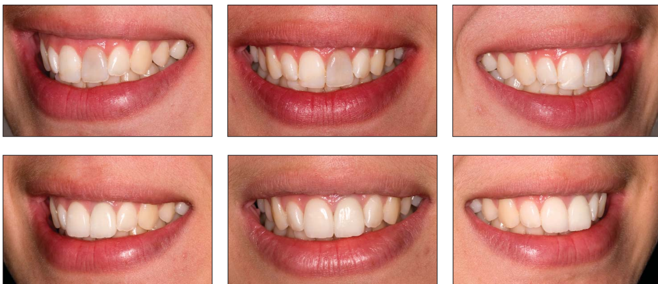
Figure 2c: a-f – Smile: Before (above) and after (below) images of the case

model which could be superimposed over the preparation model and aid in design of the frames. Margins were defined in the software and frames were designed to approximately 80% of the size of the provisional restorations. These were then milled from an Emax MO1 block via the MCXL milling unit. After approx 10 minutes the completed