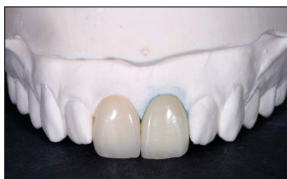
Figure 3: e – Fit on model